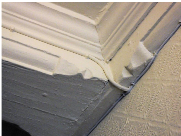
Pine frame visible in entrance hall. Wall is division between cross wing frame and hall